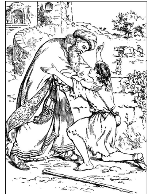
Luke 15:11-32, The Prodigal Son

We have all been Prodigal Children at one time or another, planning and executing life our own way. But no matter how far our wanderings have taken us, God waits patiently for our return. When we repent and return to Him, recognizing our failings, receiving His forgiveness, the least we can do is to live as He wants us to, with obedience. Realizing His amazing grace, how can we not then proclaim His saving word to all who are called to listen? Grace Anglican Church is committed and directed to do just that, by the power of the Holy Spirit.